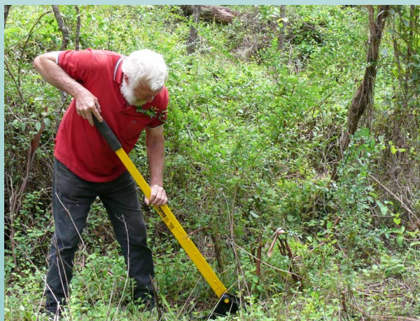
Photo : Tree popping in action