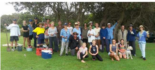
The Green Point Easter Senna Bash attracted 27 volunteers from Angourie Community Coastcare and Wooloweyah Landcare.

bush regenerators to spray bitou and ground asparagus from Spooks Point to the north end of Spookies beach.