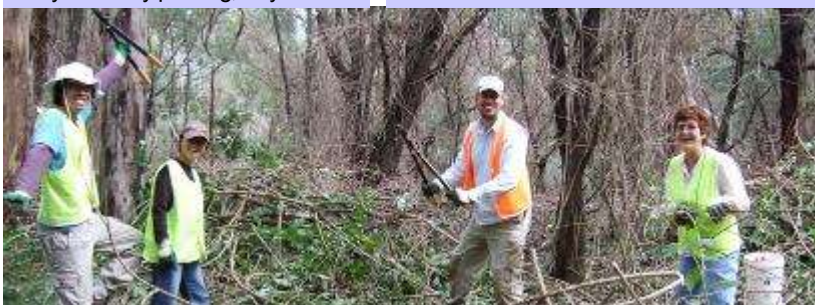
A group of volunteers hard at work