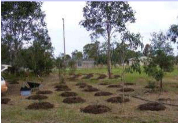
...and AFTER mulching and planting