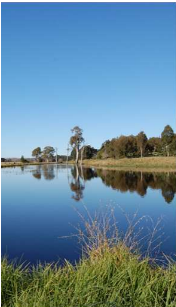
Farm reservoir which slows run-off, acts as water storage and also provides wildlife habitat. An island in the reservoir provides sanctuary against predators such as domestic dogs