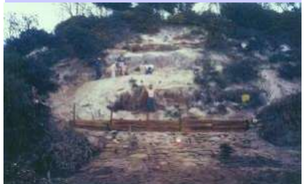
1995. Spooky Beach erosion control work in progress