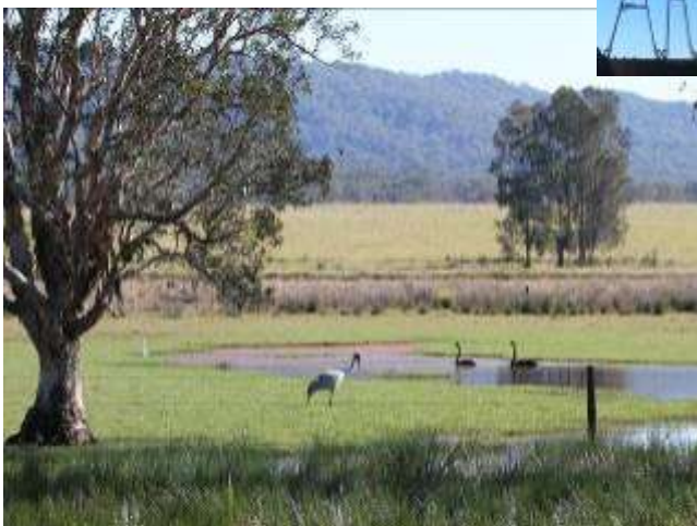
Brolga and Black Swans on the "Arndilly" floodplain