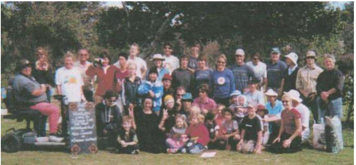
July 2001. National Tree Day—Coast Care volunteers