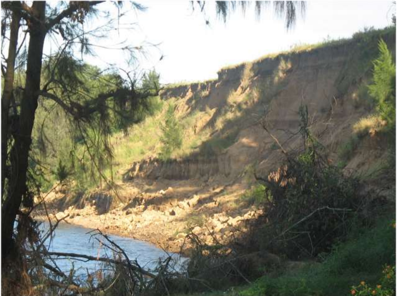
Rehabilitation of the eroded riverbank, involved Landcare, the TCMA, and local government