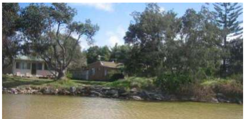
Houses on the edge of Lake Cakora

Thanks to Robyn Sharp for text information and photos