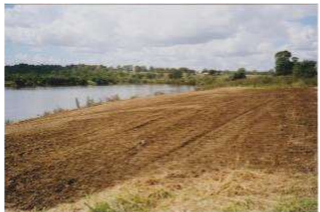
BEFORE and shortly AFTER rehabilitation work on the Clarence by Waterlands Landcare