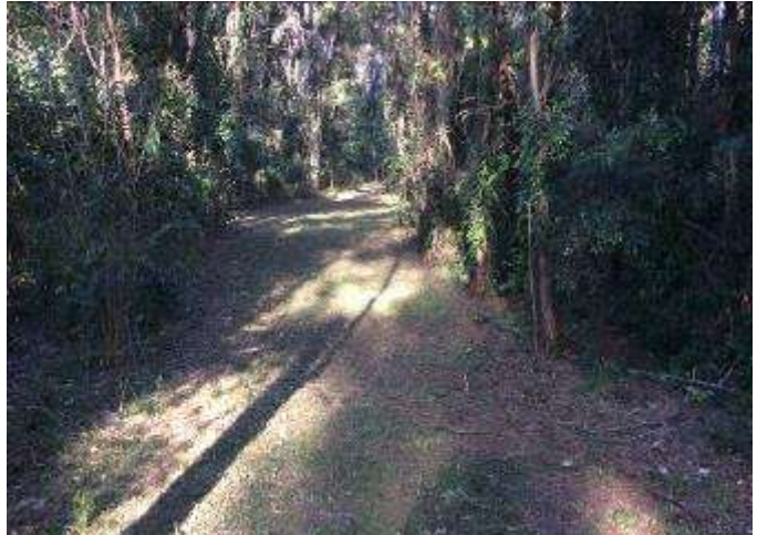
BEFORE and AFTER planting the entrance to Cowan's Pond