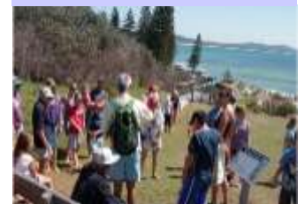
September 2010. Well attended and successful Brooms Head Coastal Erosion Day