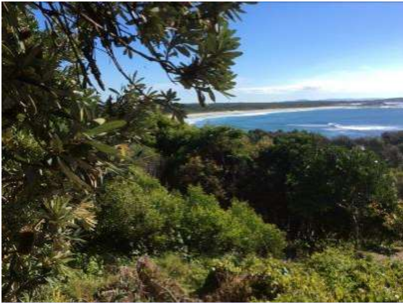
Iluka Bluff looking towards Woody Head