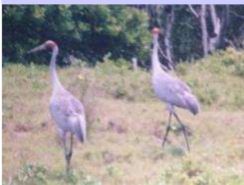
A Brolga ( Grus rubicunda ) pair

Russell's passion for wildlife spills over into wildlife photography as seen in the examples below