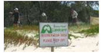
Regenerating dune area

The work Brooms Head volunteers have done, and are continuing to do, will ensure that Lake Cakora, as one of a dwindling number of similar ecological natural features on the NSW coast, will continue to endure.