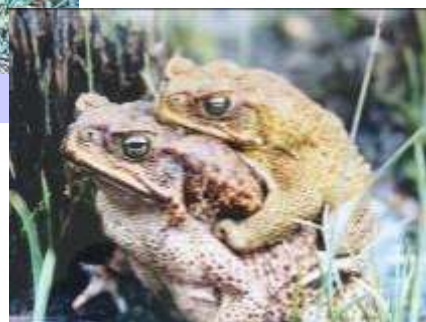
Introduced pest: cane toads ( Bufus marinus ) in amplexus