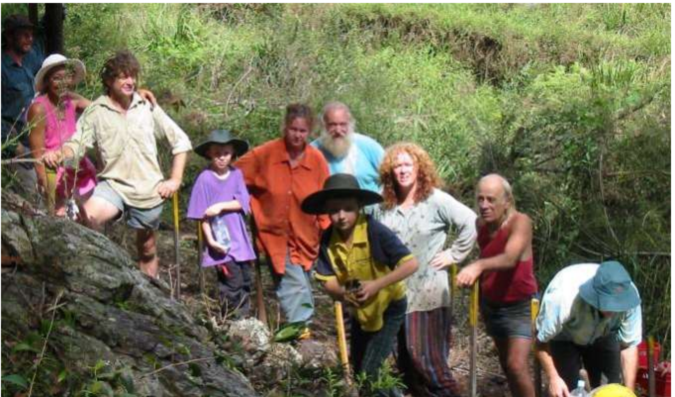
Nymboida Landcare is a reflection of a diverse community"