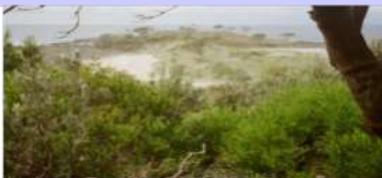
2004. The same view with the whole area revegetated.