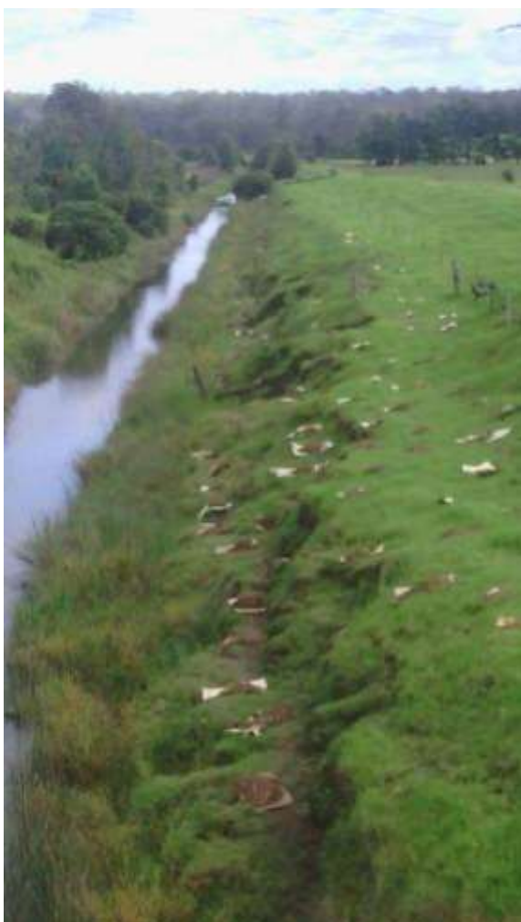
Channel with newly planted trees, of which 500 are planted annually. Note cardboard mulch for weed control in lieu of spraying chemicals