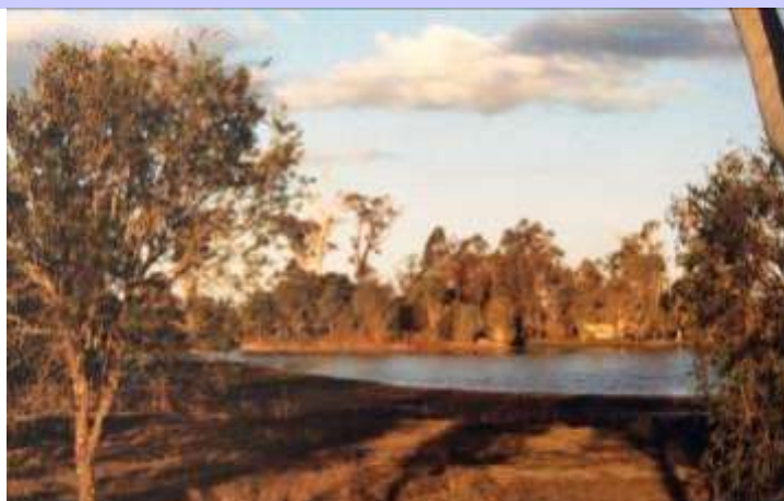
Looking across Cowan's Pond from West to East. The background was originally as bare as the foreground, which is privately owned grazing property. The bird hide is just visible on the far side of the pond