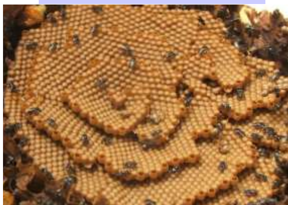
The unique shape of the honeycomb of the common native stingless bee Trigona carbonaria