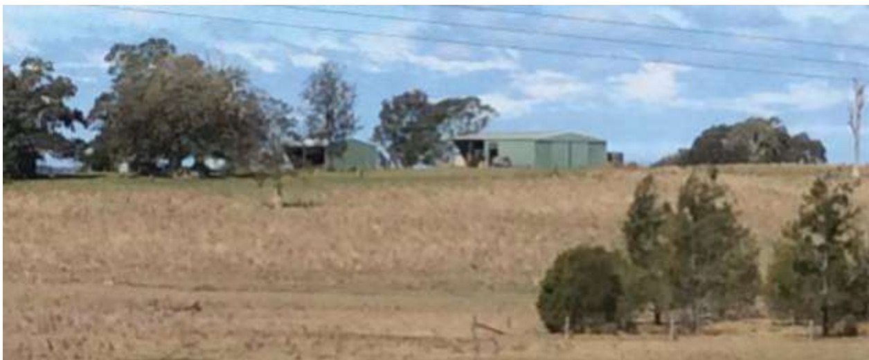
Fig Tree Farms' home paddock with fig trees on the hill in the background. In the foreground is the fenced and planted gully