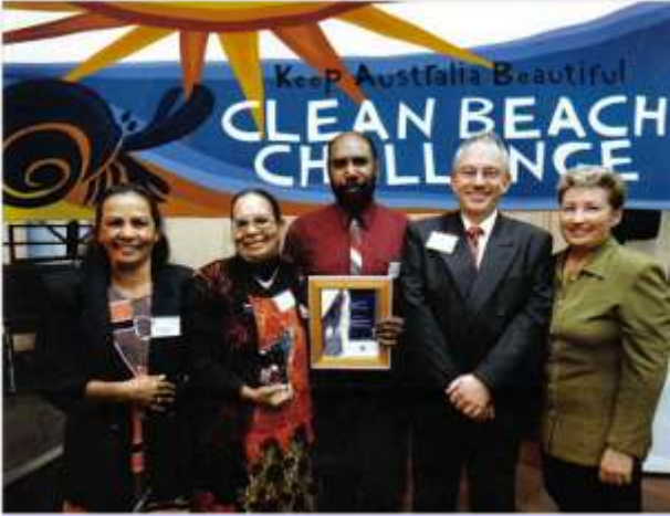
Representatives of the Birrigan Gargle Landcare Group and Birrigan Gargle Land Council accept the NSW Community Action award in Sydney on behalf of the combined Clarence Coastcare groups involved in the Landcare project