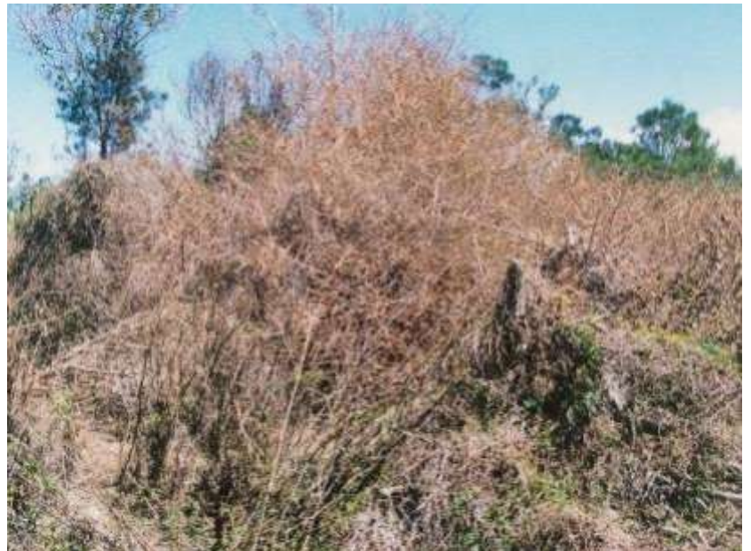
Lantana waiting to explode into flames

Thanks to Jack Claxton for information and photos