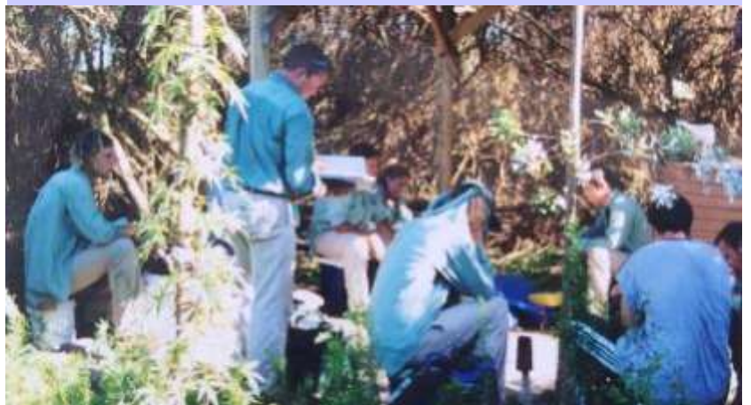
Green Corps take a break from work on the island