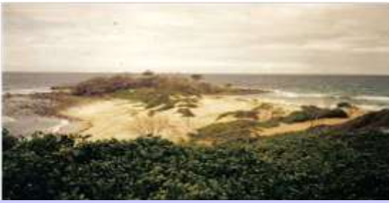
1989. Angourie Tombolo showing bitou bush "hummocks", erosion of the dune as "blow-outs" caused mainly by uncontrolled pedestrian access and wind action. Note also the severe infestation of bitou bush in the foreground