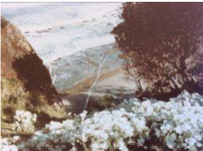
"The Hatch" Beach, 1982 — before Bitou Bush