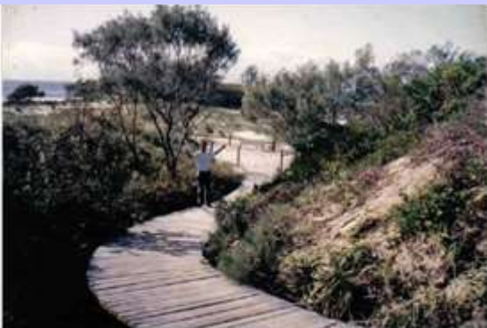
1991. Boardwalk construction to Angourie Back Beach. Following boardwalk construction, revegetation of the steep slopes was achieved by successive plantings involving a number of working bees