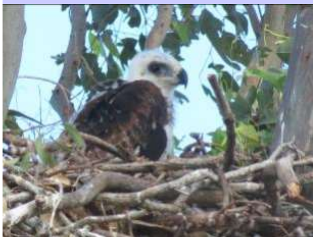
Fledgling Wedgetail Eagle ( Aquila audax ) waits for its parents to return with the next meal