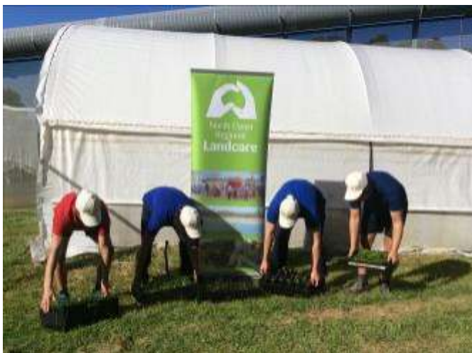
Induna students proudly display some of their propagated seeds

In addition, several Landcare groups operate their own nurseries. These include Iluka, who took over the formerly council-operated nursery at Saltwater; Peter Turland's nursery at Pillar Valley; another at Copmanhurst, and two nurseries operated by Nymboida Landcare members.