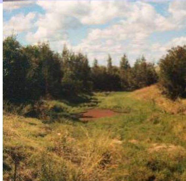
BEFORE and AFTER planting the edges of the pond overflow