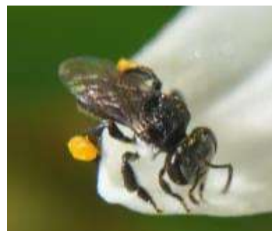
Common Native Stingless Bee Trigona carbonaria