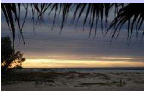
Entrance to Lake Cakora taken from slightly different angle, June 2014