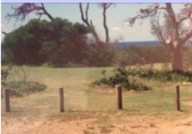
Before and after photos of the Headland at Back Beach. As well as the group's own efforts, Yuraygir Landcare has been assisted by EnviTE, Green Corps and Work for the Dole teams