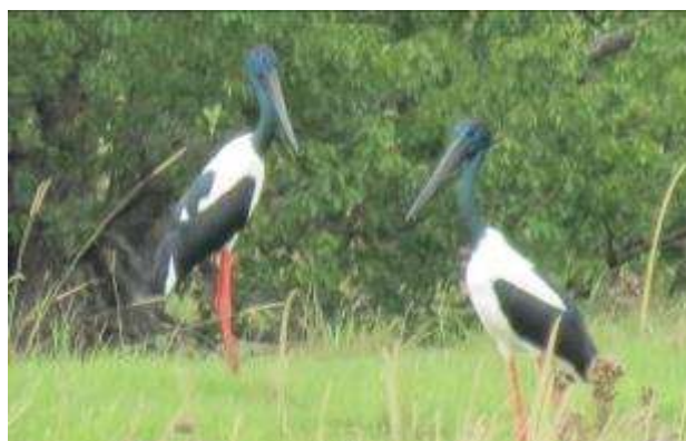
The reservoir which feeds the channels provides sanctuary for rare and threatened species such as this pair of Black-necked Storks ( Ephippiorhynchus asiaticus )