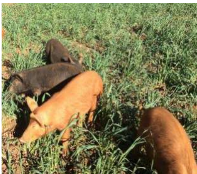
Large Black and Tamworth piglets