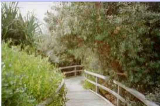
2004. Growing vegetation provides shaded beach access