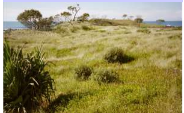
May 1994. The same area now covered with vegetation