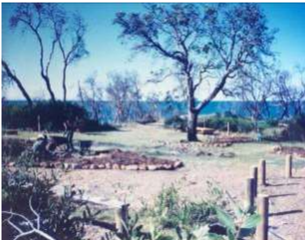
Shortly after the devastating fire of 1994

A major achievement of Yuraygir Landcare has been the restoration of Back Beach, after fires in 1994.