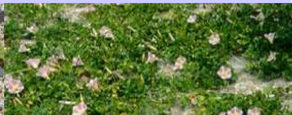
Calystegia soldanella , flower, and vine with flowers