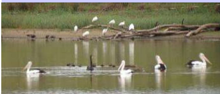
The reservoir also provides sanctuary for more common species such as Pelicans, Black Swans, Ibis and ducks