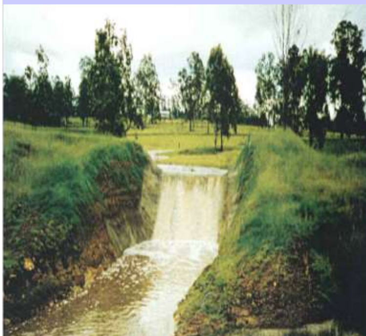
The rehabilitated area withstanding flood