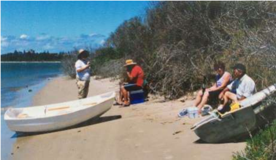
Volunteers arrive to work on Dart Island