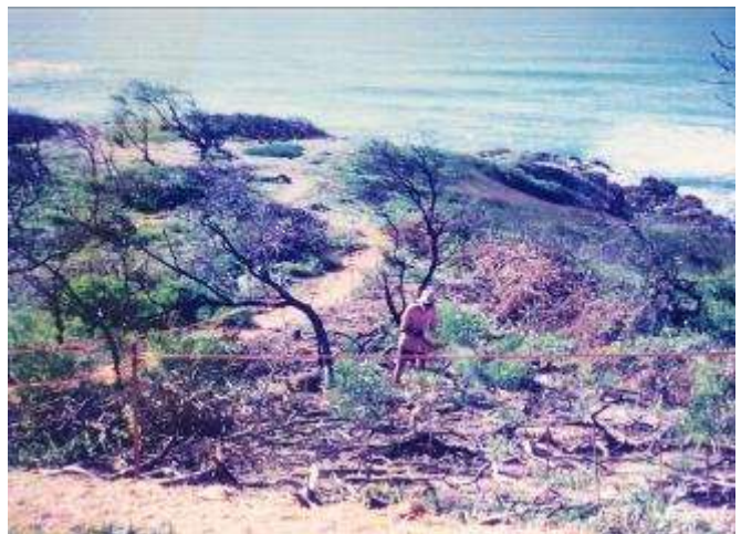
Back Beach track after the 1994 fires. Diligent restoration work by Yuraygir Landcare now ensures the maintained access track is now shaded by regrowth vegetation