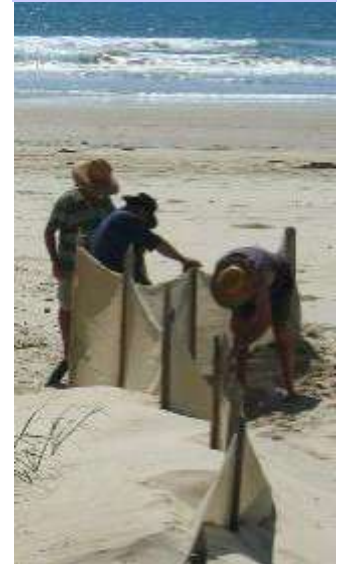
Construction of sand trap to prevent wind erosion and to enable Lake Cakora berm to rebuild