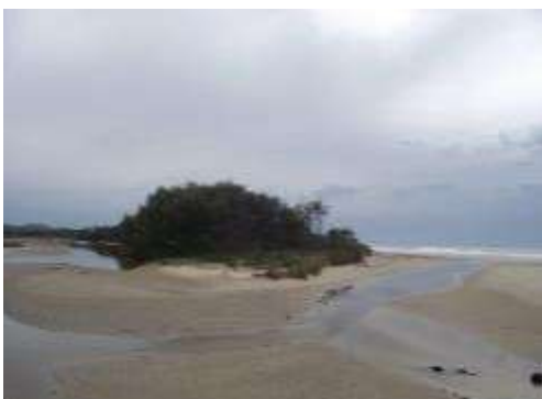
Entrance to Lake Cakora after a major storm, May 2011